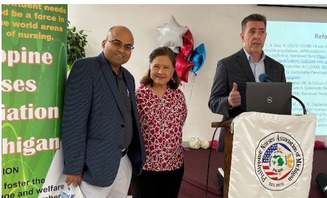
HFH representatives answering questions on recruitment

tion. Thank you all for coming and hope to see you soon.