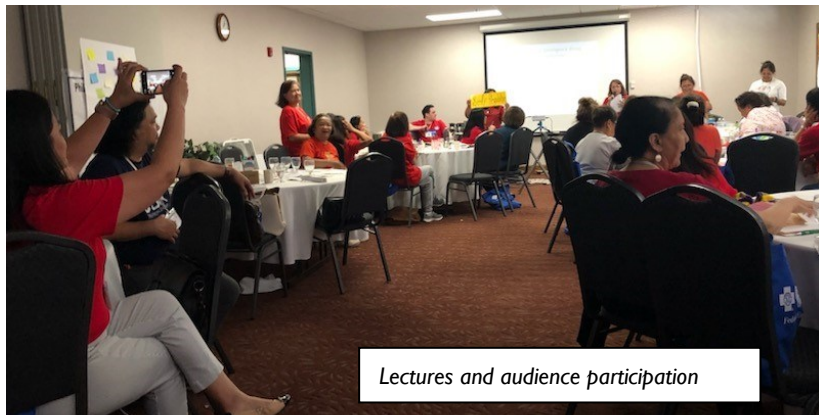
Lectures and audience participation

IRS Designations. Then we had the Pinning Ceremony and lighting of the candles. I had goosebumps all over again. The day ended with a campfire. We had s'mores, singing and heart-warming speeches. It was an exhilarating experience to reckon with.