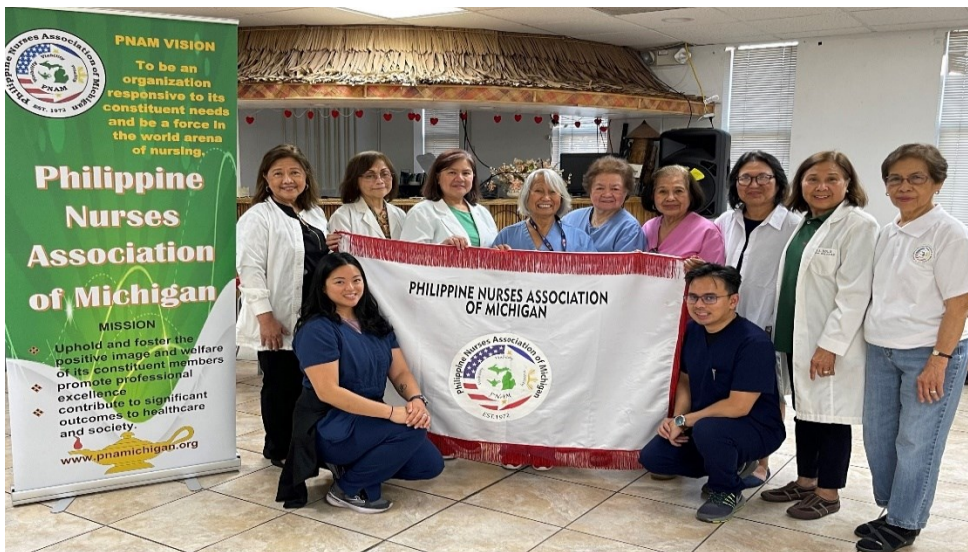
Last EB picture taken prior to PACCM move to a new location

Although the profession is still dominantly composed of women, I never felt hesitant to proceed. Many of my own male friends and classmates were also choosing to go into nursing. I suppose in decades past, the profession was perceived as primarily for women only. Is it perhaps because the formal nursing education that arose during Florence Nightingale's era was intended as training specifically for women? Many nursing education programs that were developed thereafter were adapted from the Nightingale model. According to the American Nurses Association (ANA, 2023), men represented a tiny percentage of nursing professionals by the 1970s just 2.7% of nurses in the United States were male. However, today, the percentage of male nurses is over 13%. Certain areas and specializations even see a higher percentage of male nursing: around 35% of active duty military nurses are male and 41% of registered nurse anesthetists are male.