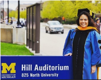
M Hill Auditorium 825 North University