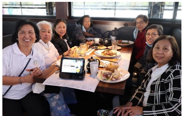
Nurses' Week Celebration, May 8, 2021