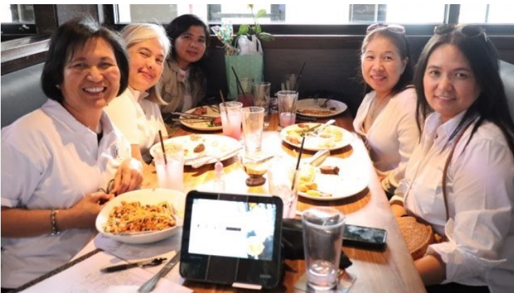
May 8, 2021, Nurses Week Treat to some Millennial Members